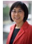
Guest Speaker Hon Pansy Wong Minister for Ethnic Affairs Minister for Women's Affairs

Breakfast at the Indian Star Restaurant Tues, 29 September 2009, 7.30am – 9.00am