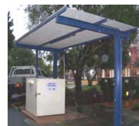
The drive in library returns

A limited number of free 30 minute parking spaces are available down the one lane driveway to the right of the main entrance.